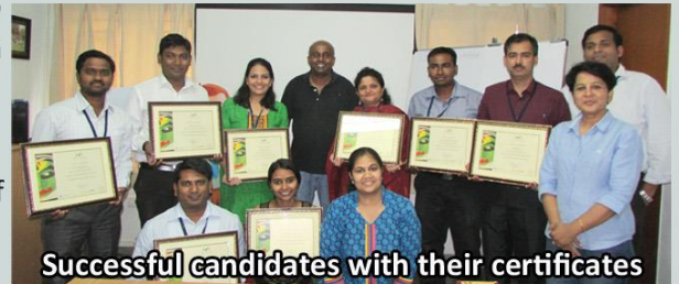
Successful candidates with their certificates

IVI acknowledges the support of Brien Holden Vision Institute Foundation and Optometry Giving Sight in funding the program.