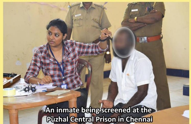
An inmate being screened at the Puzhal Central Prison in Chennai