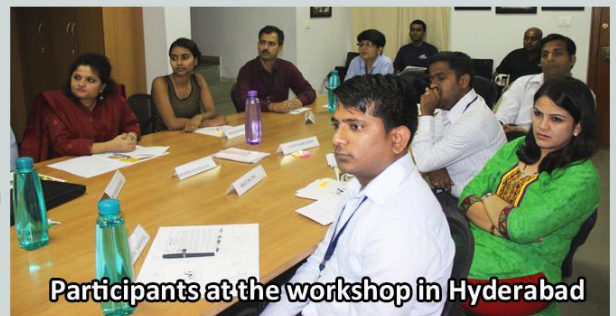
Participants at the workshop in Hyderabad