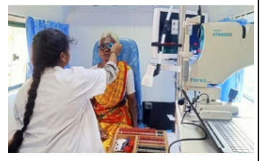
IVI acknowledges the support of Sightsavers India

Our mobile van unit provides services to urban slums and government health centres, examining 6,034 individuals from Madipakkam, Chinnandikuppam, Thiruvanmiyur, Perungudi, Kotturpuram, Kannaginagar, and Nochikuppam. Among those screened, we diagnosed refractive errors in 2,534 individuals and another 1,502 individuals were referred to nearby tertiary eye care hospitals for further medical interventions.