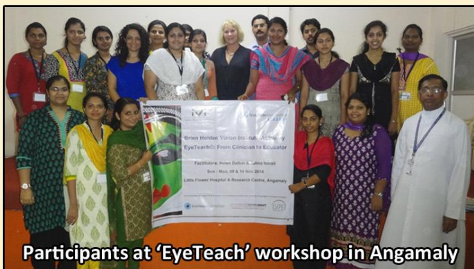
Participants at 'EyeTeach' workshop in Angamaly

IVI acknowledges the support of Brien Holden Vision Institute Foundation and Optometry Giving Sight in funding this program.