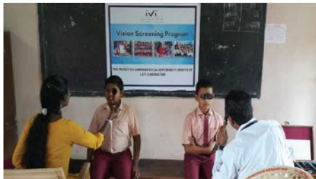
IVI acknowledges the support of 'L&T Construction' for funding the program.

Under the Eye See & I Learn initiative, IVI screened 3,032 underprivileged children from government, government-aided and Adhi Dravider Welfare schools in Dindigul and Thanjavur districts. As many as 232 children diagnosed with refractive errors will receive free spectacles.