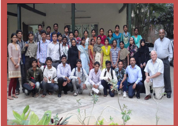
Participants of Making Difference

Over 35 optometry students from Sarojini Devi Eye Hospital, Hyderabad attended this seminar.