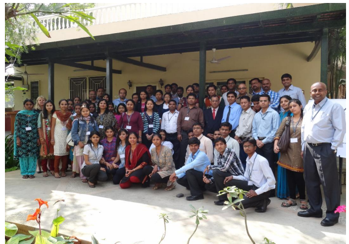
Participants of the Forum on Refractive Errors

The forum also recommended that strategies such as minimizing barriers to eye care delivery in rural areas, education in Optometry field, active involvement of practitioners through online forum and Optometry reaching out to underprivileged can minimize the occurrence of uncorrected refractive errors impacting over a 100 million people in India.